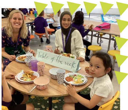
TABLE OF THE WEEK

Towards the end of the week the children got their cooking skills on and made delicious jam sandwiches. They each look turns to spread the jam and cut their bread into four squares. This activity started conversations about how this is a popular favourite for some children, and how some children make these sandwiches at home.