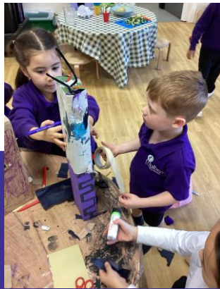
TABLE OF THE WEEK

We cannot believe that the first half term is finished already! We have truly enjoyed getting to know our Blue Whale and Tiger Classes – they are an incredible group of curious, kind and creative children. Have a wonderful half term break and we cannot wait to see everyone on Monday 30th October.