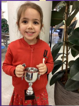
TABLE OF THE WEEK

Every week we reward children for positive behaviors around lunchtime, such as good manners, playing with the resources safely and with kindness, and trying new food. Well done to: