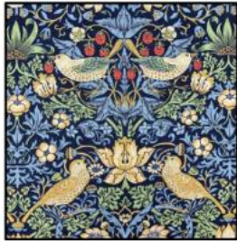
Strawberry Thief (1883) by William Morris

This term in Art, Year 2 pupils will be exploring printmaking and experiment with a variety of printing techniques to create repeated patterns inspired by the famous designer William Morris. Pupils will begin by making prints using everyday and natural objects such as leaves, fruit and vegetables. They will learn how pressure, ink and surface choice affect the quality of a print. Children will also make their own printing blocks, including simple relief blocks and collagraphs created by building textured surfaces with collage materials.